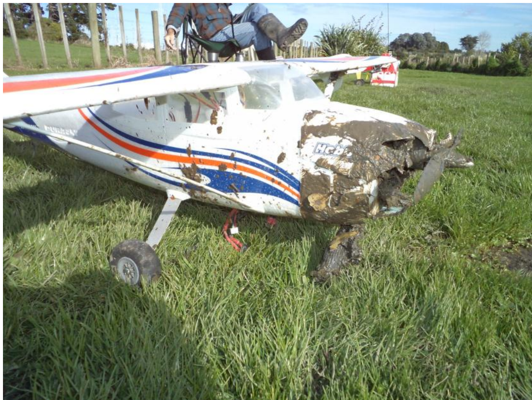
One of the club trainers found the mangrove, has now been brought back to new