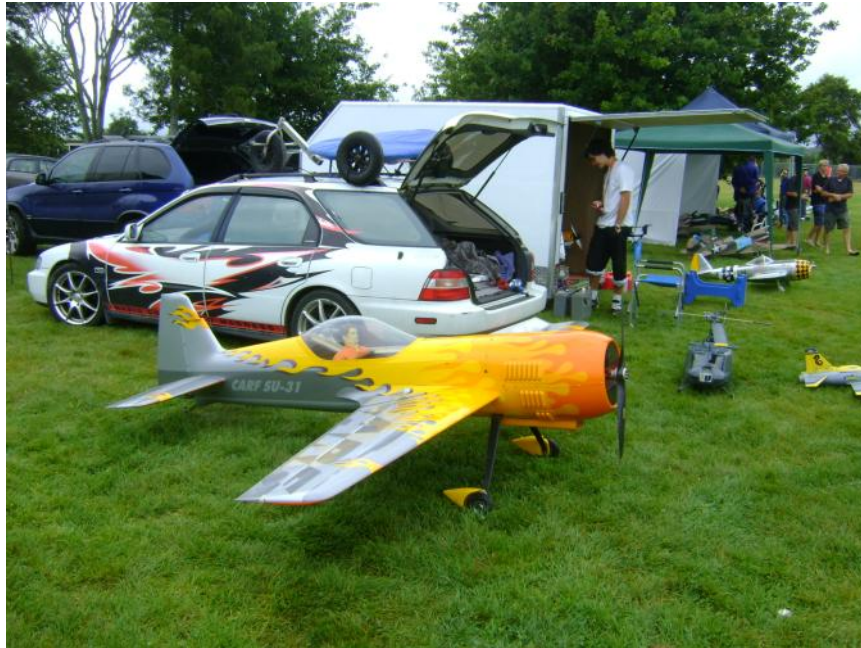
Big planes at Clevedon flyin