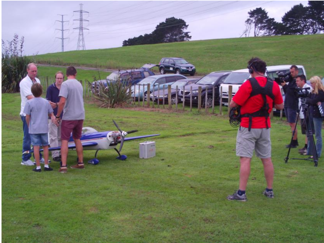
TV filming at Highbrook, 'Kids get inventing'